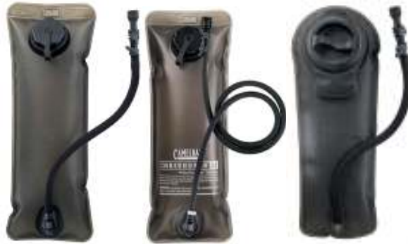
Examples of CamelBak Reservoirs (L to R: 100 oz MG Long Neck Replacement Reservoir – SKU 90392, Chemical Biological Reservoir – SKU 60172, 70 oz. Omega Replacement Reservoir – SKU 90721)